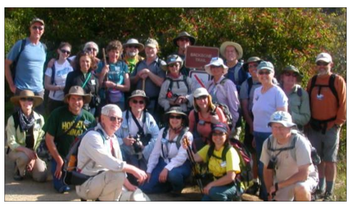
On the 2010 Backbone Trail Trek, twenty hikers with the leader and two sweeps stop for a trailhead photo.

The spring rains treated all to an abundance of wildflowers. There was a count of 142 different blooming species during that week. The weather was near perfect with cool hiking days and balmy evenings. Cheerful and congenial hikers supported by dedicated and enthusiastic volunteers made this event a success.