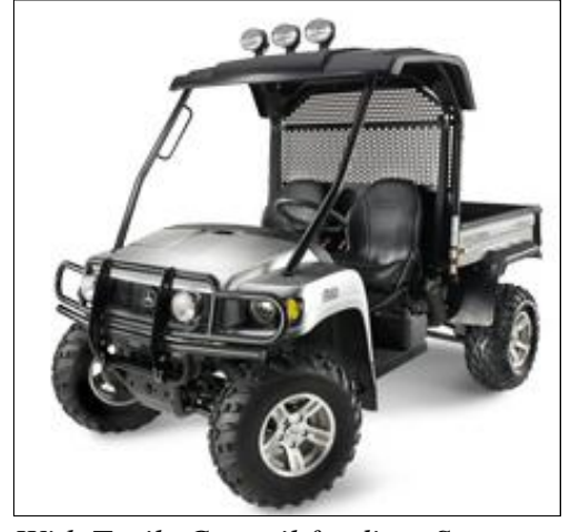
With Trails Council funding, State Parks will be buying a John Deere Gator utility vehicle similar to the one shown here.

A new utility vehicle is being funded by the Trails Council for State Parks in the Santa Monica Mountains to haul heavy tools and supplies to work sites, especially to sites far from trailheads. Funding for the approximately $10,000 purchase was approved by the Trails Council board on September 23.