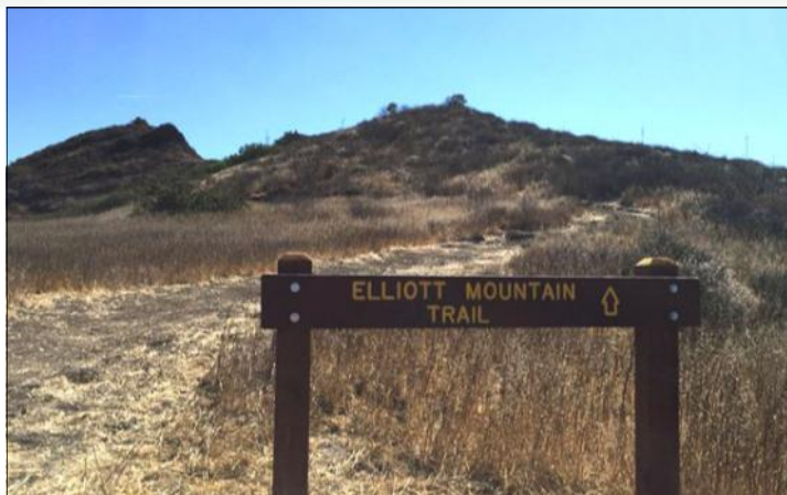
A combined effort of SMMTC and COSCA built the Elliott Mountain Trail.