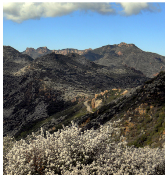
Boney Mountain, viewed from the trail east of Yerba Buena Road

CAMP SITES are extremely limited along the Backbone Trail. Since camping outside of designated campgrounds is prohibited, thru-hiking is not possible at this time. Existing camp sites differ widely in their amenities and were not designed to support thru-hiking. A forthcoming Trail Management Plan will propose backcountry camps along the trail that would be managed through a permit system. Public comment on the environmental review document for the plan is expected in 2017, and pending outcome of the public review, possible construction in the years that follow.